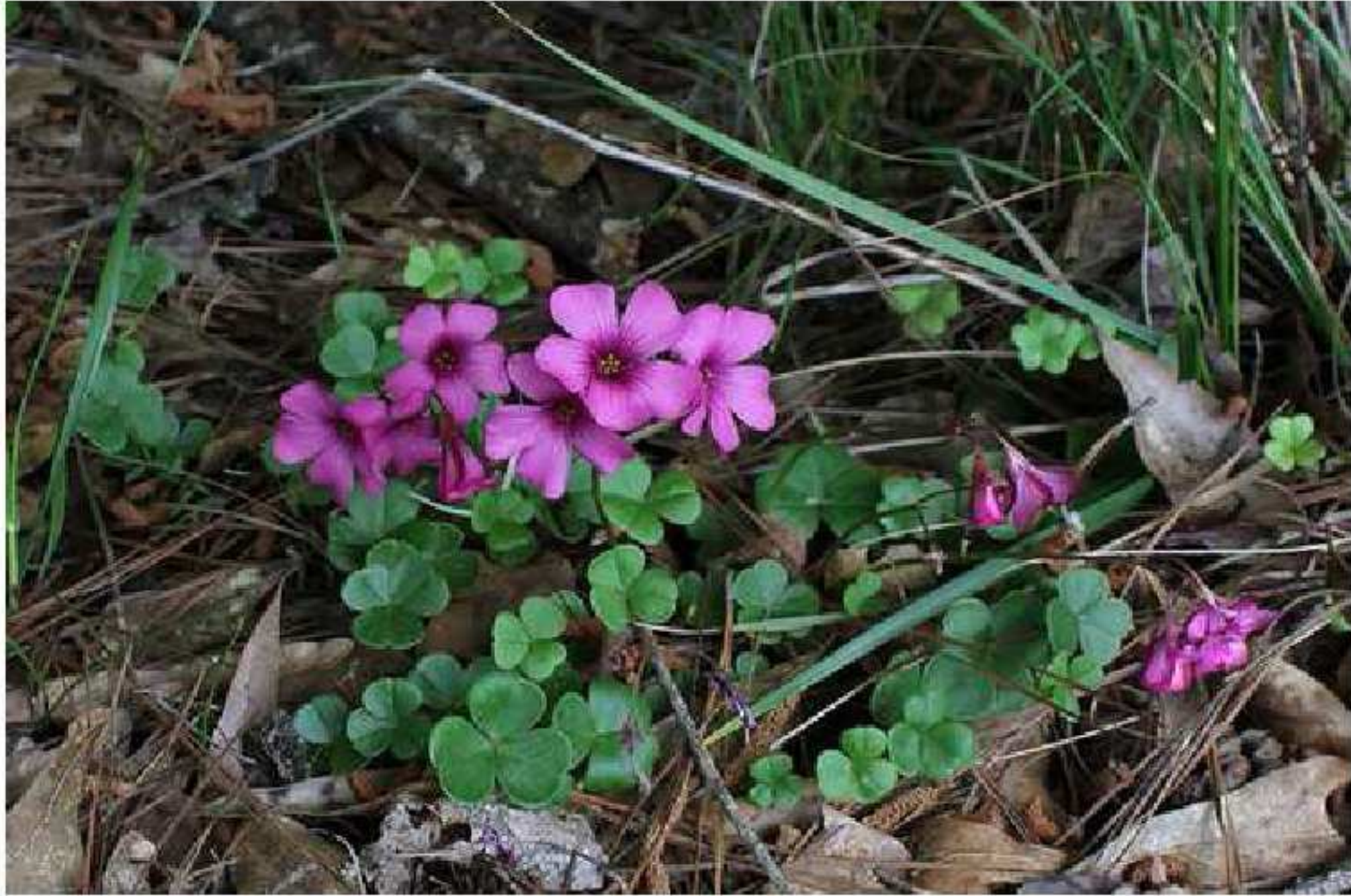
Figure 3. Growth habit of Oxalis brasiliensis in Dallas Co., Alabama. Photo by Wayne Barger, 23 May 2013.

structurally identical, if somewhat underdeveloped, to those of bulbils produced underground." In fact, the present authors have not found any other mention in literature of such non-bulboid propagules in Oxalis like those produced in O. brasiliensis . Lourteig's description (translated from Spanish) of O. brasiliensis (2000, p. 557) noted that "aerial bulbs were sometimes present in the inflorescences."